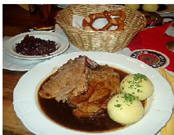
Wild Pig, Red Cabbage & Klumpsa at the Paulaner Restaurant