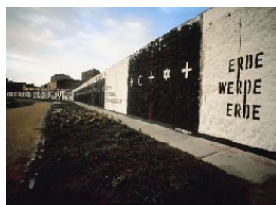
Berlin Wall Memorial