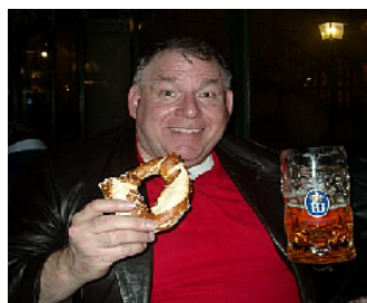
Having a Bier at the Hofbräuhaus