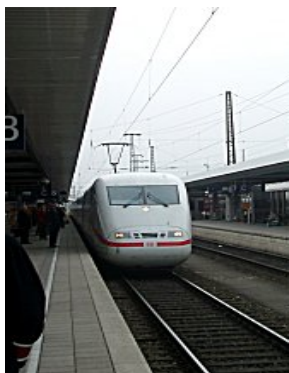
ICE (InterCity Express) Pulling into the Station